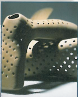
FAST & CLEAN